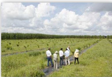
A field of young pongamia trees in southern Florida, which will produce an oil feedstock.

In response to litigation from interest groups, court decisions issued in the first half of 2013 have generally upheld the LCFS. However, these challenges have resulted in some delays in implementation of parts of the LCFS, including a recent delay of the increased 2014 target. The LCFS will remain at the one percent reduction level (the 2013 target) through 2014. Despite the marketplace uncertainty caused by such changes, the LCFS has delivered a fuel mix with lower carbon intensity. In 2012, Cali-