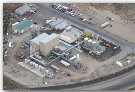
ZeaChem's demonstration-scale facility in Boardman, OR, processing woodchips for conversion to ethanol.

Advanced biofuel production is key to compliance with two important policies: the federal Renewable Fuel Standard (RFS) and California's Low Carbon Fuel Standard (LCFS). RFS is a volumetric mandate that requires specific levels of a variety of renewable fuels each year and includes an advanced biofuels mandate. The LCFS is a performance standard that requires a gradual reduction in the carbon intensity of California's fuel mix between 2011 and 2020. We use our domestic capacity projections to assess the industry's potential to meet these standards and discuss the policies themselves in section V. For both standards, it is possible there will be additional capacity beyond projects tracked by E2.