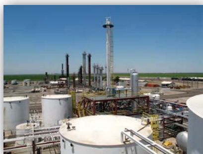
Crimson Renewable Energy, LP – Bakersfield Biodiesel and Glycerin Plant.

Since our first report in 2011, we have been tracking 2015 closely, as this is the first year in which RFS and LCFS targets start to ramp up more aggressively, and advanced biofuel production may reach a point of inflection. 1 As reference, U.S. Energy Information Administration projects 214 billion gallons of total transportation fuel use in 2015, 2 so this would represent approximately a 0.7% replacement. Further, 2015 may be the first year with sufficient advanced biofuel production to allow an accurate assessment of the eventual success of the two programs. Last year E2 projected 2015 capacity at 1.6 - 2.6 billion gallons. Our updated number is just below last year's estimate, primarily due to the delay of some projects and cessation of others. Still, our lowered estimate could provide adequate fuel to meet U.S. fuel standards, as discussed on page nine.