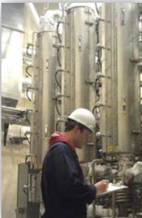
Virent’s demonstration-scale facility in Madison, Wisconsin. Virent is testing a variety of feedstocks for conversion to renewable gasoline, diesel, and jet fuel.

This report assesses only active advanced biofuel projects. We do not include projects that have been canceled or otherwise deferred. This is particularly important when comparing reports across years, since projects included in one year may be removed the next.