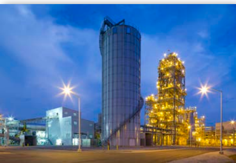
KiOR's commercial-scale facility produces drop-in gasoline and diesel in Columbus, MS. Began operating in 2013.

To develop our low-end production capacity numbers, we include projections only from those facility plans that have demonstrated progress toward completion. These projects have significant disclosed details such as financing, location, feedstock partnerships, permitting, and more.