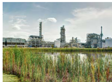
INEOS Bio's commercial-scale facility converting municipal solid waste into ethanol in Vero Beach, FL. Began operations in 2013.

Looking towards 2016, there is real potential for advanced biofuels to scale up. Today, numerous facilities are on track towards commercialization, and the industry is moving steadily forward. New investments and regulatory certainty will help ensure the successful commercialization of these projects.