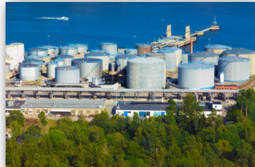
Fuel storage facility in Stockholm, Sweden.

E2 compiled a list of 24 companies working internationally on advanced biofuel projects of particular interest to the U.S. This does not reflect the full scale or capacity of the global market, but should be understood as a survey of international activity that could be imported to the United States or technologies that may be licensed domestically. See Appendix D for a list of these companies.