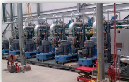
Edeniq's Cellunator mill produces sugar from plant materials.

Although there are not any announced plans for cellulosic butanol production in the coming years, this could be an attractive alternative for some companies exploring the alcohol-as-fuel market, as butanol may be blended with gasoline up to 16% without modification to vehicles.