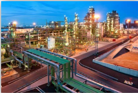
Neste Oil's NExBTL plant in Rotterdam.

Global advanced biofuel development and production continues at a strong pace. Several European companies are producing cellulosic ethanol and renewable jet fuel at commercial scale. In Brazil, conventional sugarcane ethanol production continues to expand, both for domestic consumption and global export. 12 Producers are also working towards reducing the fuel's carbon intensity. In 2012, Brazil exported 540 million gallons of sugarcane ethanol to the United States, which continues the increasing trend since 2009. 13