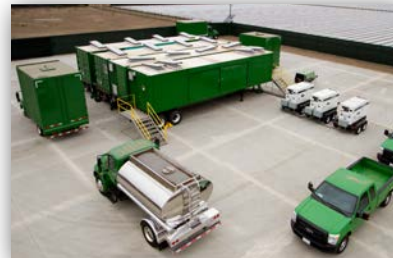
Cool Planet's pilot plant in Camarillo, CA. The first biorefineries will be built in Louisiana using woody biomass.

As detailed in the 2012 market report, there are a variety of different tax incentives and programs to encourage biofuel facilities, jobs, and related economic activity inside particular states. Variation in state-level incentives can prove to be a decisive factor when companies choose where to locate. For example, this summer Cool Planet publicly announced it will move its headquarters to Colorado from California owing to tax incentive that will save them $3M, provided they create 393 new jobs in the coming years.