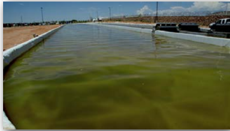
Sapphire Energy's Half Acre Algae Pond at its research facility in Las Cruces, NM.

Dozens of additional partnerships are listed in Appendix A. Details of each partnership are typically listed on bio-fuel companies' websites.