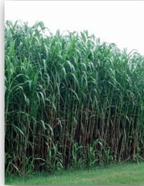
NexSteppe's Palo Alto High Biomass Sorghum.

foria displaced 1.06 billion gallons of traditional fuels with lower-carbon fuels, thus lowering the carbon intensity of the overall fuel mix. 21 The policy is providing reduced greenhouse gas emissions from the transportation sector, and overall is working as intended.