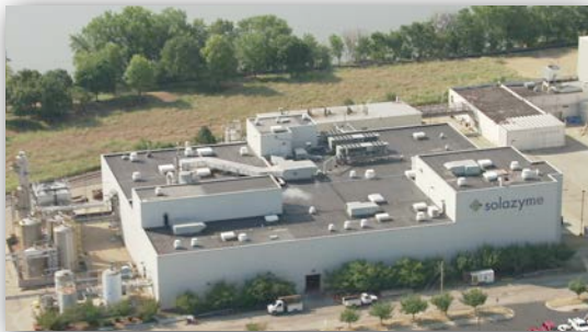
Solazyme's integrated biorefinery in Peoria, IL has produced renewable oils since June 2012.

These figures vary from company to company, and across fuel type. Joule Technologies reported operating